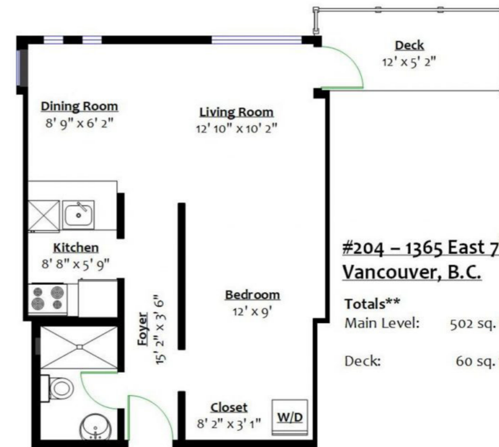
MAIN LEVEL Floor Area: 502 Sq. Ft.